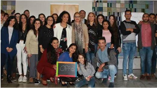
3rd Workshop, Espinho, April 2017

programme and specialized technical support, awareness raising and family and community mediation, as well as individual support and tutoring for the students.